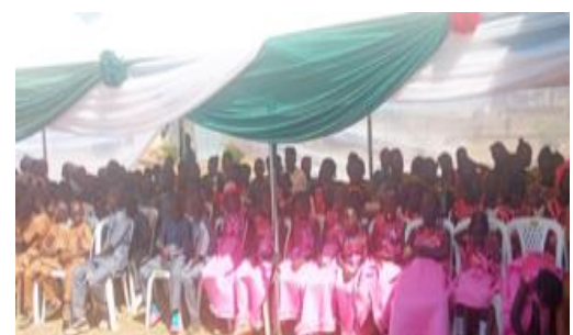
OVCs in their Christmas dresses