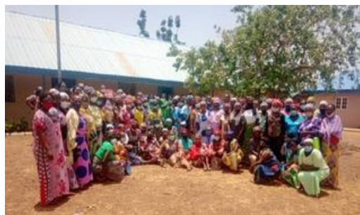
Widows gathered outside the Gweimen center during the pandemic

Consider how you might help this important work to continue. You can give through the mail or online.